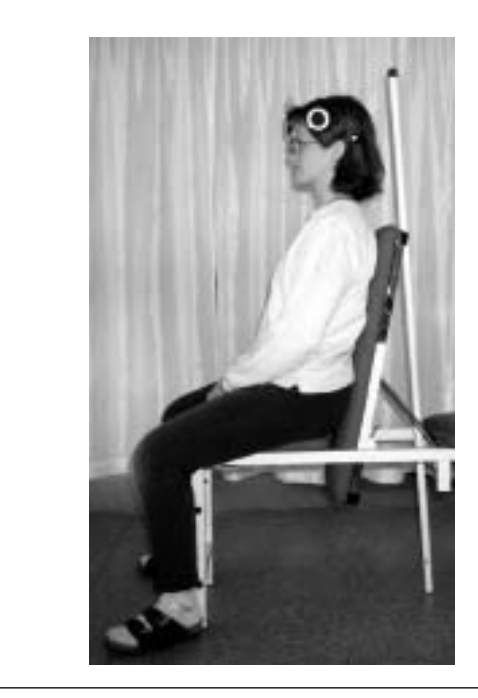
Fig. 2a. Starting position

Means, standard deviations (SD), and confidence intervals (CI) for AROM and NPRS scores were calculated for both groups. An unpaired t-test was used to compare the preintervention means of these characteristics between the two groups in order to evaluate for pre-intervention equivalence. We used chi-square tests to similarly evaluate for preintervention group equivalence with regard to subgroup categories.