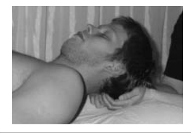
Fig. 1. Inhibitive distraction

Recruitment of subjects and data collection took place over a 3-month period. The sample used in this study was a sam-